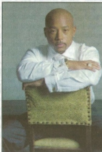
Daymond John, FUBU CEO and author of "Display of Power"

form the multi-million-dollar business now known as FUBU. From pencils to reconditioned cars, John displayed an entre-